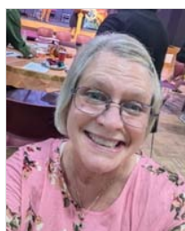
Vicki Lawrence October 7th